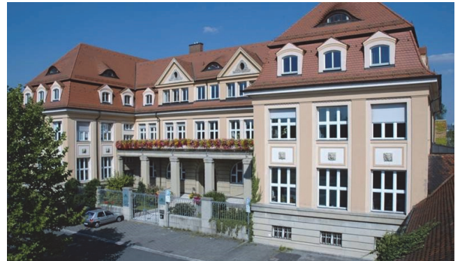
Riedhammer main office in Nuremberg

Riedhammer provides various solutions from revamping up to new turn-key plants based on the most advanced technology and proven reliability. Tradition and experience are conjoining here as best with state of the art development, engineering, construction and commissioning to a new generation of furnaces including all required auxiliary equipment.