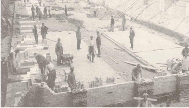
First Riedhammer Baking Furnace