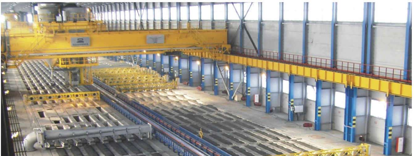
Open Top Anode Baking Furnace

Engineers and technicians of the Riedhammer team are trained to optimize projects progresses in the sense of the client. That results in minimized project run-times, minimized costs and maximized return on investment.